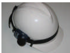
CEL-6354 hard hat clip set