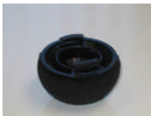
CEL-6356 foam windscreen