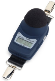
CEL-350 Micro noise dosimeter