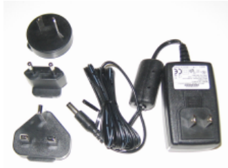
CEL-PC18 power supply