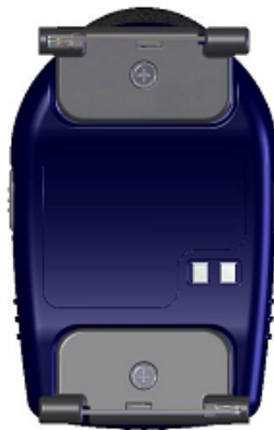
CEL-6351 mounting clip