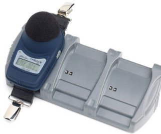
CEL-6362 3 way master charger

CEL-6362 3 way master charger unit and universal power supply