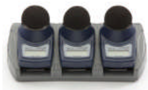
CEL-6358 slave charger unit

CEL-6363 3 way slave charger unit and link cable to master charger