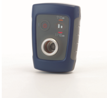
CEL-120/2 acoustic calibrator