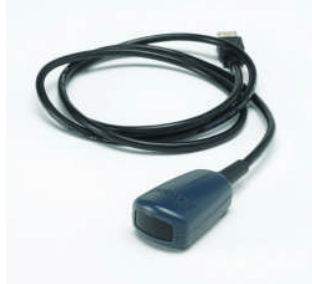
193200B IR interface adapter

193200B High speed USB Infrared communication interface adapter