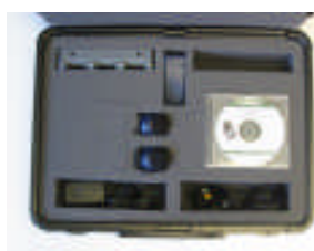
CEL-6355 multiple unit kit case