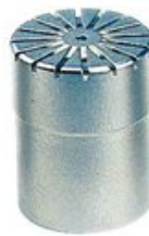
CEL-252 microphone capsule